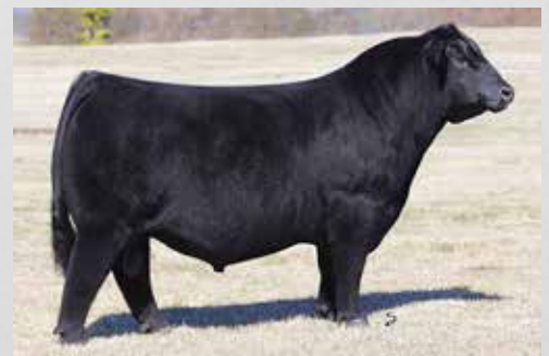
Conley Express 7211 Sire of Lots 4-7

S A V MADAME PRIDE 8283 S A F 598 BANDO 5175 S A V MADAME PRIDE 1093 S A V MADAME PRIDE 8265