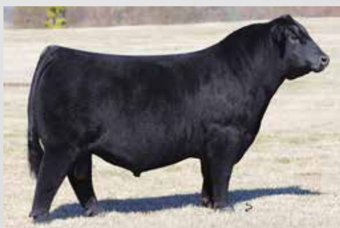
Conley Express 7211 Sire of Lot 7

S A V 8180 TRAVELER 004 S A V ELBA 7627 S A V ELBA 1094