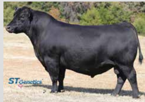
Penners Tops 5238 Sire of Lots 8 and 12

SOO LINE MOTIVE 9016 ZWT DIXIE ERICA 2743 O C C DIXIE ERICA 861M