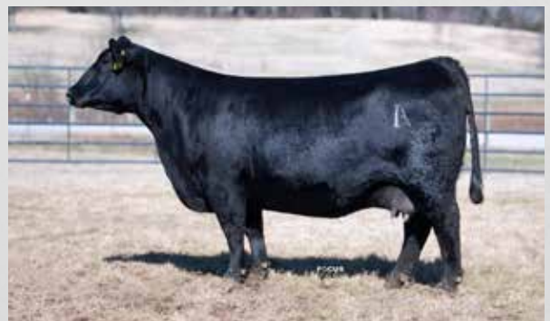
Ingram Everelda Entense 7621 Dam of Intensity

COLEMAN JUNEAU 044 COLEMAN EVERELDA ENTENSE2406 BT EVERELDA ENTENSE 613L