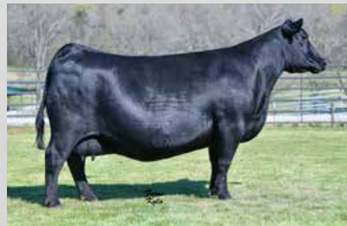
S A V Elba 0522 Dam of Lots 6 and 7

A beautiful daughter of Conley Express 7211 back to a daughter of SAV Pioneer 7301 and the $50,000 SAV Elba 0522. Grandmother is a full sister to the $37,000 SAV Elba 4436, who went on to produce the $60,000 Buford Elba 9000. Third-generation dam of this female is the $100,000 SAV Elba 1094, who is one of the top income producers in the Schaff Angus Valley. This female stems from a dam that records BR 7@96, WR 7@101, UREA 22@102.