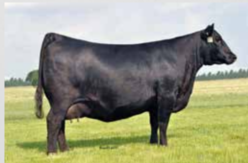
Buford Elba 9000-Maternal Grandam of Lot 10 and 11.

S A V BISMARCK 5682 BUFORD ELBA 9000 S A V ELBA 4436