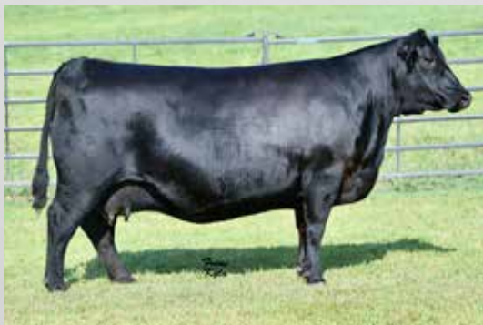
Coleman Donna 3209 Dam of Lot 15 embryos

Sire S A V EMBLEM 8074 Dam COLEMAN DONNA 3209