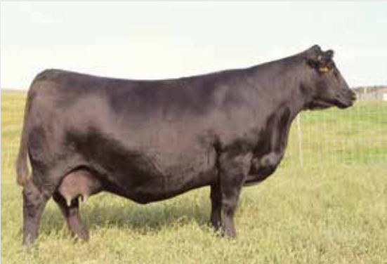
S A V Blackcap May 8961 Dam of Lot 13 and 14 embryos

Sire S A V RAINDANCE 684 Dam S A V BLACKCAP MAY 8961