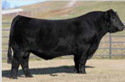
S A V Extension 6856 Sire of Lot 9

DS BISMARCK 4035 INGRAM GENEVETTE 7123 DS GENEVETTE 1914