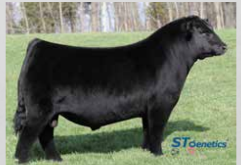
Conley Dieckmann Prowess-Sire of Lots 10 and 11

A direct daughter of the ST Genetics AI sire, Conley Dieckmann Prowess, who stems back to a daughter of Rito 707 Of Ideal 3407 7075 and the $60,000 valued Buford Elba 9000. Dam is a full sister to the granddam of Lot 10. This female had an individual birth ratio of 86 and stems from a dam that records BR 4@91, %IMF 2@122.