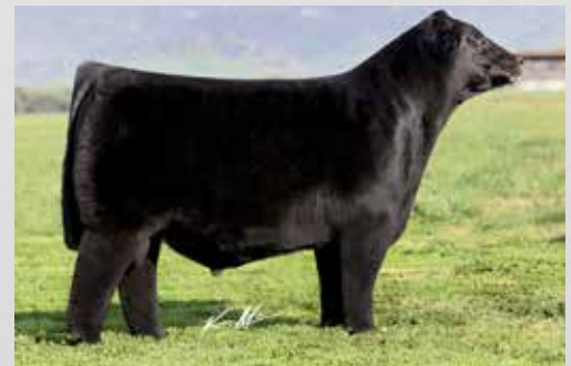
Colburn Primo 5153 Sire of Lots 1,2 and 3

S A F 598 BANDO 5175 S A V MADAME PRIDE 1093 S A V MADAME PRIDE 8264