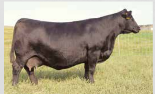
S A V Blackcap May 8961 Dam of Outlaw

SELLING TEN UNITS OF SEMEN. Ingram Outlaw 9222 was the top-selling bull of the 2021 Ingram sale where he sold for one-half interest for $25,000 to Breeder Link, Janssen Angus, Bonner Farms, Bucksnot Ranch, Reisig and Wilson Farms. He is a son of the $47,500 Semex AI sire, SAV Renovation 6822 by the $150,000 SAV Blackcap May 8961, and a full brother to the $185,000 SAV Jesse James 0968. A full sister was the $52,500 feature and Lot 1 female of the 2020 Ingram sale, Ingram Blackcap May 0607.