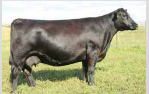
S A V Madame Pride 8283 Dam of Lots 1, 2, 3, 4 and 5

SILVEIRAS WATCHOUT 0514 SMA WATCHOUT 482 2K BEAUTY 961 CONLEY EXPRESS 7211 SILVEIRAS STYLE 9303 DPL SANDY 3040 K N C CABIN CREEK SANDY 804