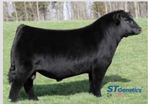
Conley Dieckmann Prowess Sire of Lot 10 and 11

RITO 707 OF IDEAL 3407 7075 BUFORD ELBA 754B BUFORD ELBA 9000